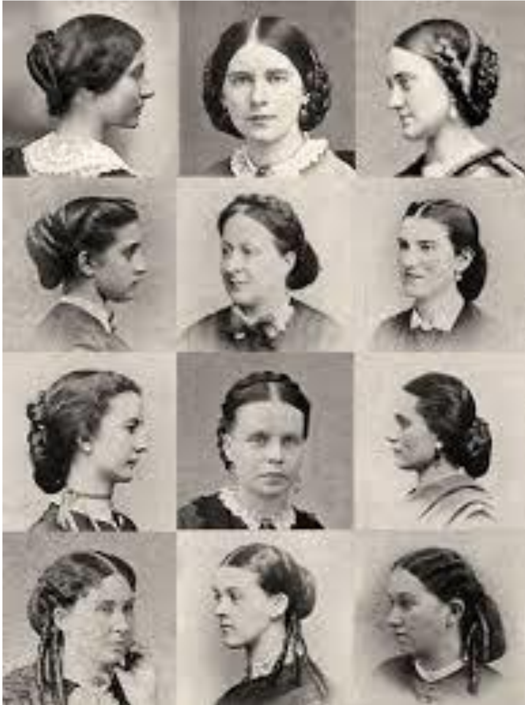
Illustration of Sample Hair Styles of the 1860s